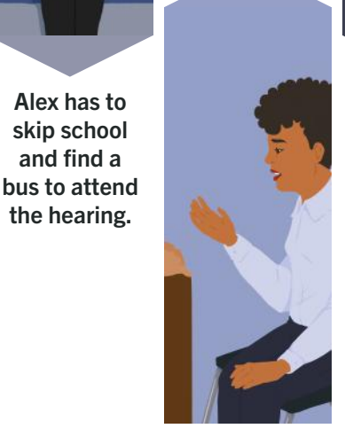
Alex gets approval to have an abortion without parental notification and they can finally